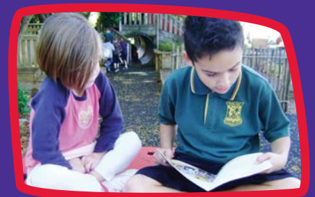
Above: Children from Parkland School often act as reading buddies for the younger kindergarten children

The teaching team at Parkland Kindergarten attended a specialist 'Transition to School' course at Massey University. Within hours, they had implemented a new practice whereby the teacher taking the children on their school visits now takes a camera, with the children deciding what pictures to take. This process recognises that everyone has funds of knowledge based on their experience, knowledge and skills. By documenting the visit from a child's own viewpoint as a learning story, it gives teachers, children and parents the chance to share their experiences and perhaps discover concerns that they can help to overcome. During one such visit, for example, children didn't know what the