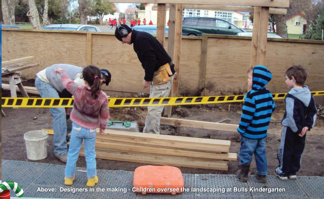
Above: Designers in the making - Children oversee the landscaping at Bulls Kindergarten