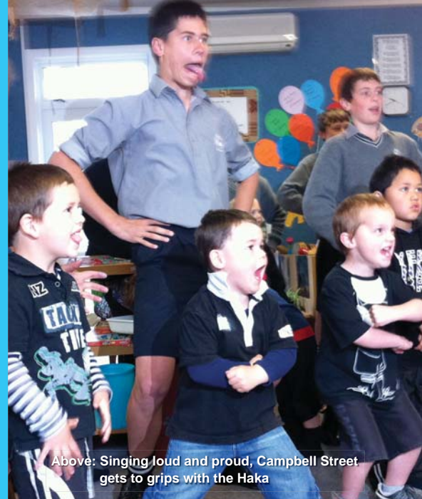
Above: Singing loud and proud, Campbell Street gets to grips with the Haka