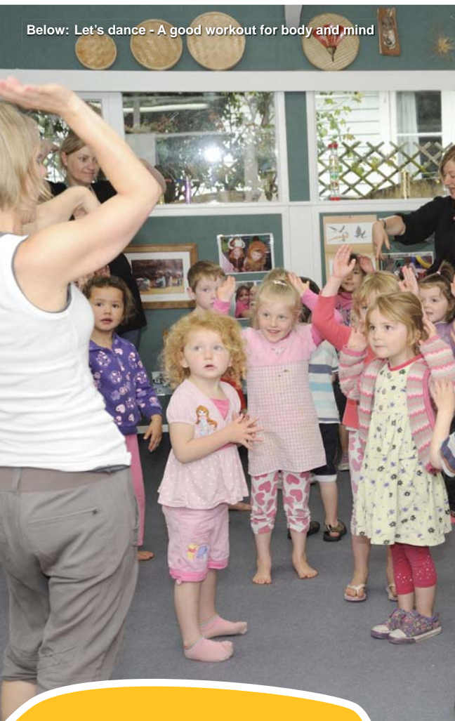
Below: Let's dance - A good workout for body and mind